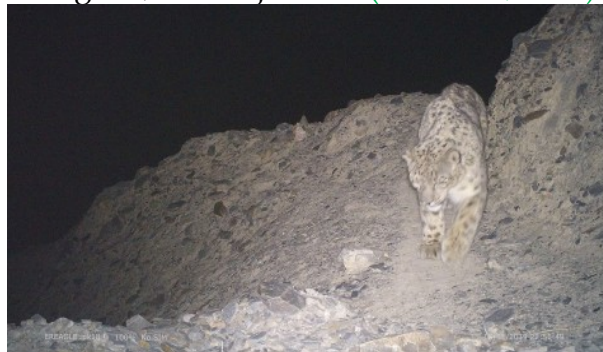
FIGURE 1 Snow leopard photo captured at the Khunjerab National Park, Pakistan.

creatures is decreasing due to factors such as poaching, retaliation, and habitat damage; their numbers range from 2,710 to 3,386 (Li et al., 2020), and climate change (Alexander et al., 2015). The annual poaching of snow leopards has ranged from 221 to 450 instances, or around 4 per week, since 2008. Over 90% of these occurrences take place in only five countries: Pakistan, China, India, Mongolia, and Tajikistan (Din et al., 2022).